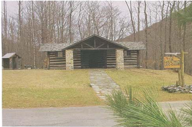
A 1936 chestnut log cabin typifies the rustic architecture made famous by the Civilian Conservation Corps.