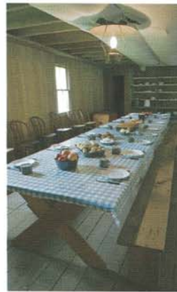
The Mess Hall

The Pennsylvania Lumber Museum , located in the high plateau country of the Commonwealth, tells the story of the choices and changes made by nature, Native Americans, early settlers and modern society that have shaped our forests since the beginning of time. To showcase the diversity, heritage and history of this lumber era, museum tours begin in the Visitor Center with exhibits, an orientation video and sales shop. Logging camp exhibits include two of